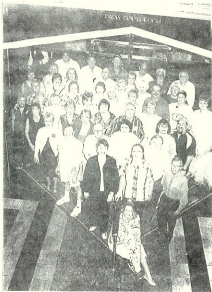
ELKS #572 CARIBBEAN CRUISE 1/21/05