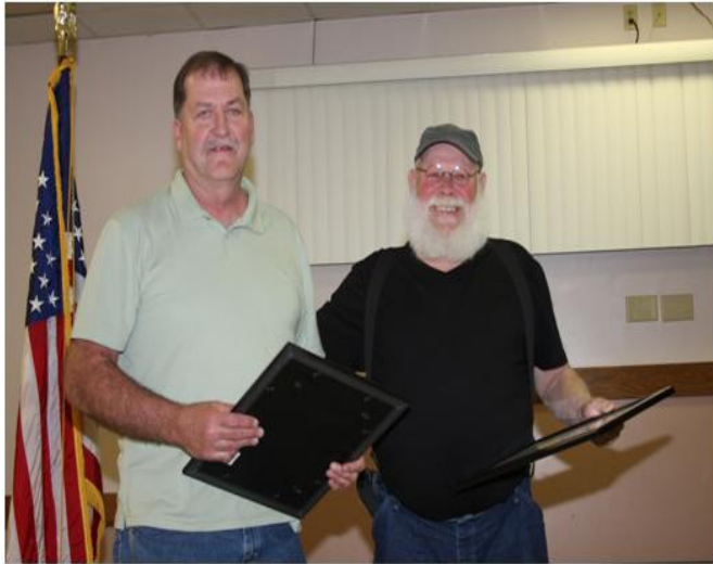
G.E.R. Special Commendation Awards for Outstanding Service to their Lodge