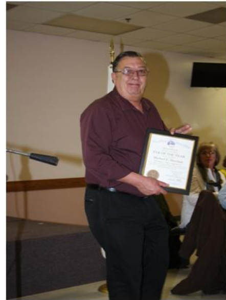
ELK OF THE YEAR AWARD 2013-2014