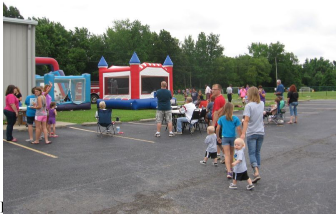
Parents and Children begin to arrive for Youth Fun Day. The 2 Bouncy Houses, in background, were very popular!