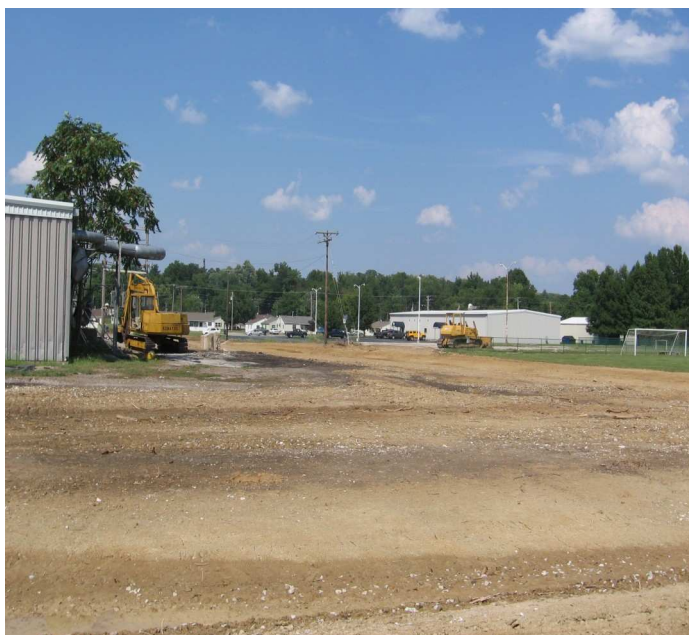
Lodge #572 is now in the OPEN , as a result of land clearing & drainage work on adjoining property now owned by M'boro Soccer, Inc.