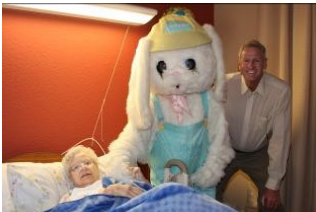
#572 Elk's Bunny brings Easter Cheer to Manor Court at Liberty Village in Carbondale.