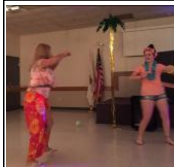
MEMBERS ENJOY HULA HOOP & LIMBO CONTEST AT LODGE LAUA