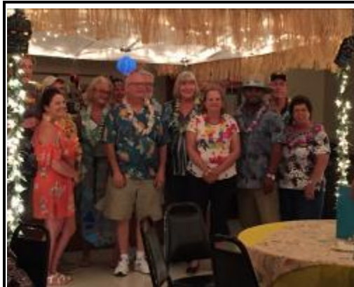
LODGE OFFICERS UNDER THE TIKI HUT ATTENDED A FUN EVENING AT THE HAWAIIAN LAUA