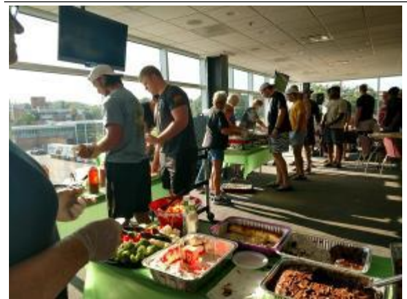
SIU football players line up for a Mexican feast served by Lodge 572 members