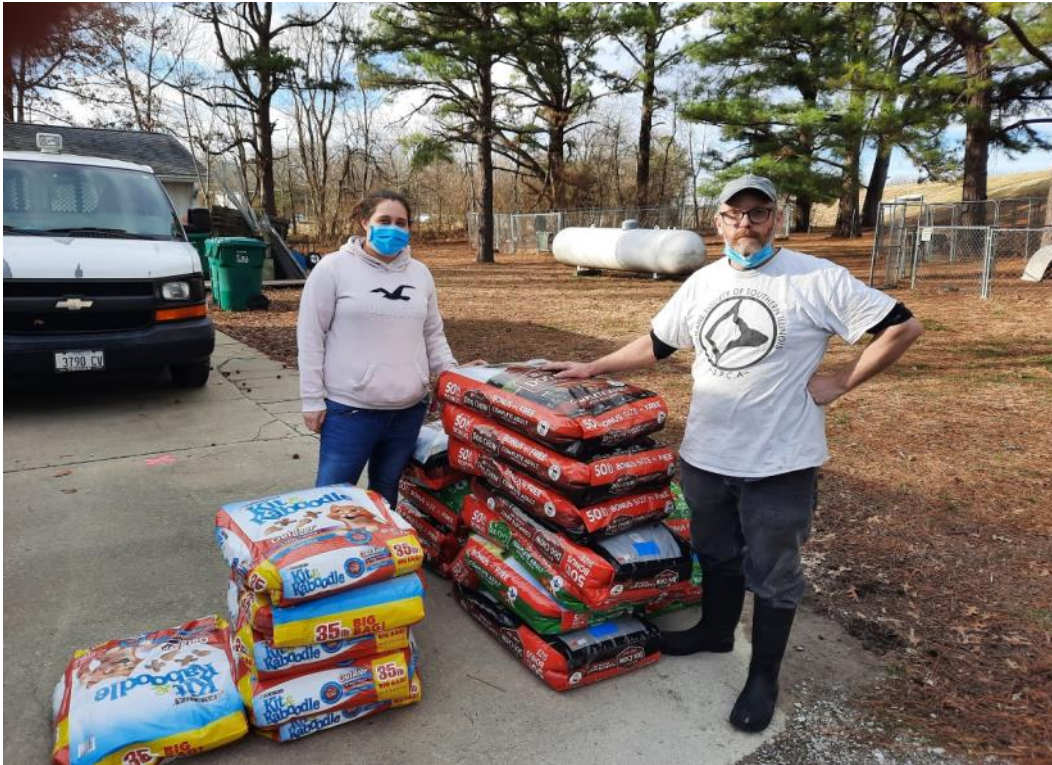
The pandemic has affected shelters that care for animals! Here, representatives of the Jackson County Humane Shelter accept delivery of food supplies provided by Lodge #572, through our ENF Gratitude Grant.