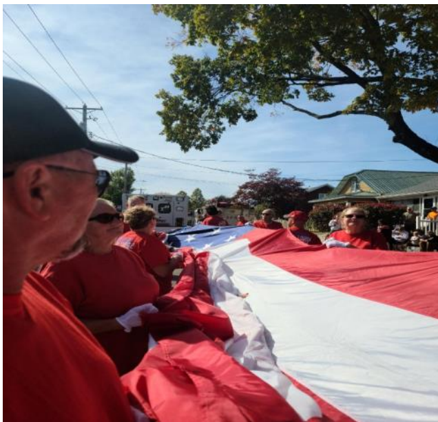
Lodge #572 Flag Team prepares to open Flag at recent Fall Festival in Chester.