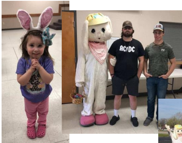
A possible, "future" Elk is all smiles and dressed up to meet Mr. Bunny; Murphysboro Lodge Antler members serving as able Bunny Assistants; Mr. 572 bunny oversees Easter Egg hunt in grassy area around the Lodge.

MOTH-ERS DAY BRUNCH MAY 12, 2024 9:00 am—12:30 pm in the Lodge Hall For all Elk Families and their guests MOTHER EAT FREE Adults $9.00 Children 3—12 $5.00 (under 3, free)